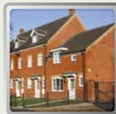
Flats to 5 bedroom houses