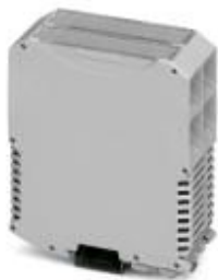
DIN rail housing, Complete housing with metal foot catch, tall design, with vents, width: 45 mm, height: 99 mm, depth: 114.5 mm, color: light gray (7035)

Please be informed that the data shown in this PDF Document is generated from our Online Catalog. Please find the complete data in the user's documentation. Our General Terms of Use for Downloads are valid ( http://phoenixcontact.com/download )