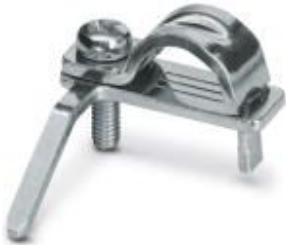
Shield connection clamp for printed circuit terminal block

Please be informed that the data shown in this PDF Document is generated from our Online Catalog. Please find the complete data in the user's documentation. Our General Terms of Use for Downloads are valid ( http://phoenixcontact.com/download )