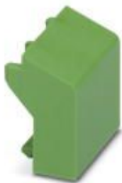
DIN rail housing, Filler plug for unoccupied terminal points, color: green (6021)

Please be informed that the data shown in this PDF Document is generated from our Online Catalog. Please find the complete data in the user's documentation. Our General Terms of Use for Downloads are valid ( http://phoenixcontact.com/download )