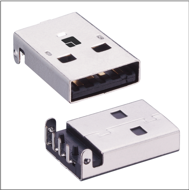
USB 2.0 chassis plug type A, angular version, for printed circuit boards