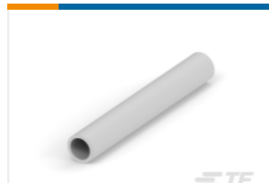
TE Model / Part #5054234003 Dual Wall DWP-125 Stick HS Tubing