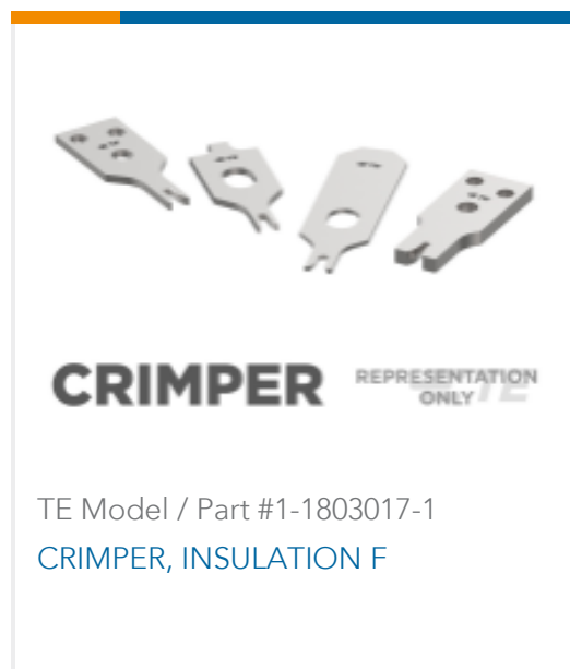
TE Model / Part #1-1803017-1 CRIMPER, INSULATION F