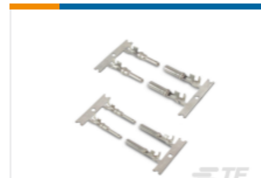
TE Model / Part #1062-16-0177 DEUTSCH STAMPED & FORMED CONTACTS