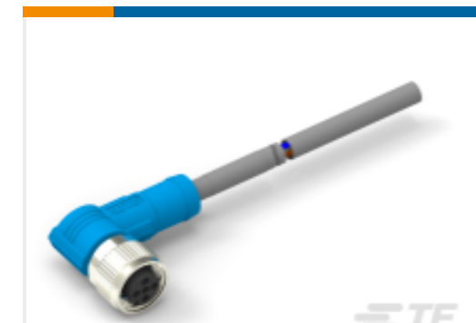
TE Model / Part #T4151410004-002 M12 A-CODE FEMALE R/A SINGLE ENDED CABL