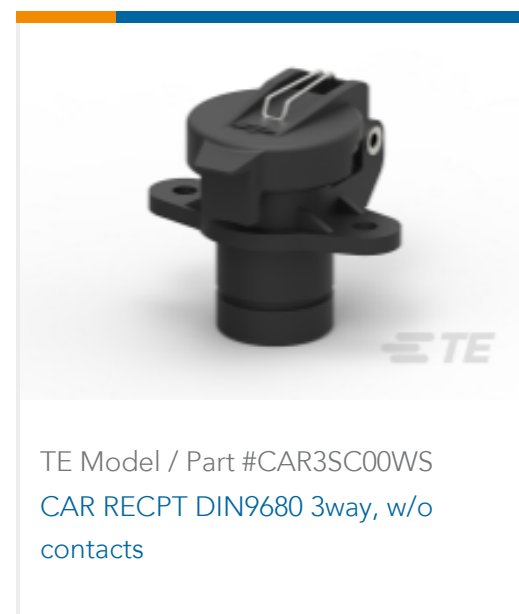
TE Model / Part #CAR3SC00WS CAR RECPT DIN9680 3way, w/o contacts