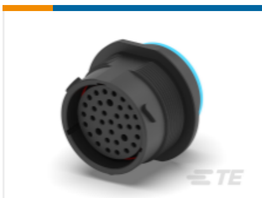
TE Model / Part #HDP24-24-35SE REC, 35P, BLK, E, 16/20, S