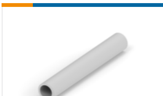
TE Model / Part #5054234003 Dual Wall DWP-125 Stick HS Tubing