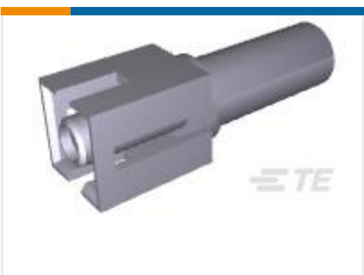
TE Model / Part #926472-1 UNIV.M-N.L.CAP S.C.