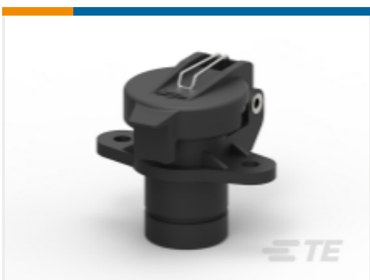
TE Model / Part #CAR3SC00WS CAR RECPT DIN9680 3way, w/o contacts