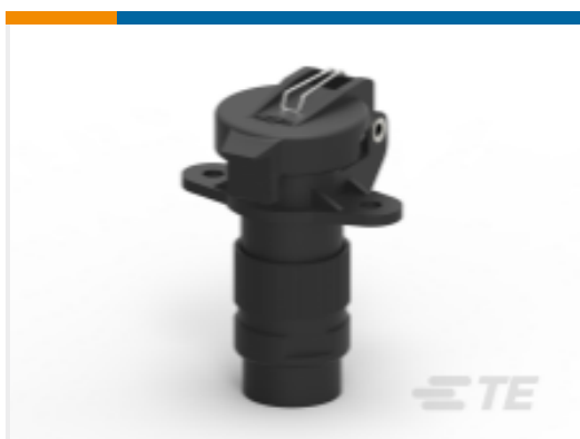
TE Model / Part #CAR3SC00 CAR RECPT DIN9680 3way