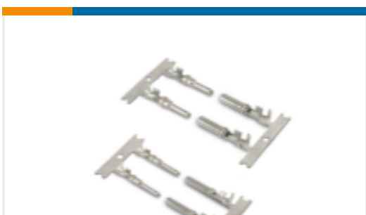
TE Model / Part #1062-16-0177 DEUTSCH STAMPED & FORMED CONTACTS