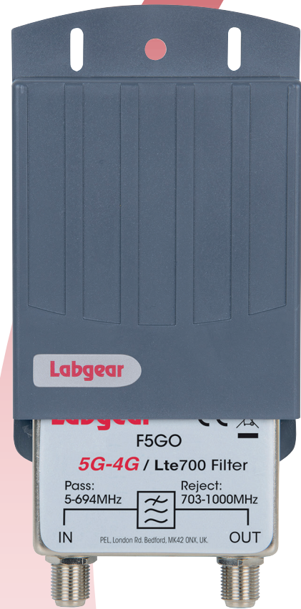
F5GO Masthead Outdoor 4G-5G Filter with F Connections