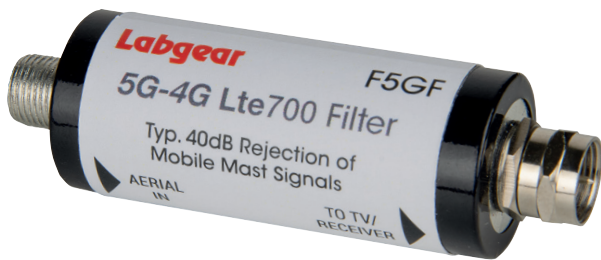
F5GF Indoor 4G-5G Filter with F Connections

Compact barrel filter with F connections ideal for indoor in-line connection at any convenient point between aerial and TV. With metal housing female F connector input male F connector output.