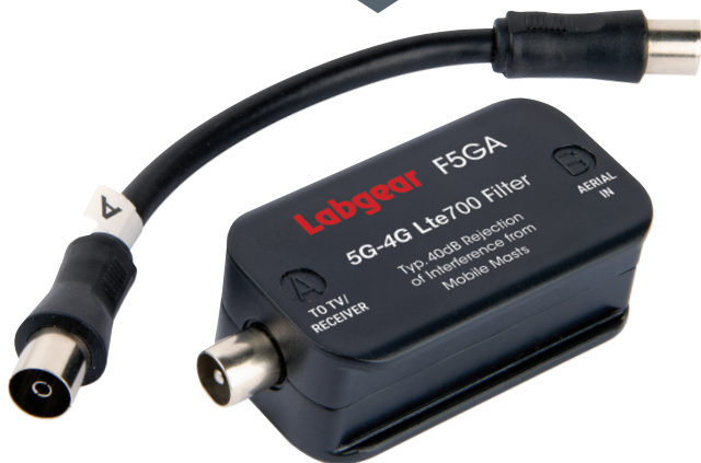
F5GA Indoor 4G-5G Filter with Coax Connections

Easy to install in-line filter with coax connections, supplied with a short coax cable for direct connection to the TV. Ideal for non technical installers. Compact plastic housing clearly labelled for foolproof installation