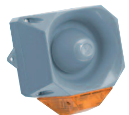
Asserta Midi Sounder Beacon Grey