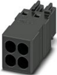
PCB connector, number of positions: 2, pitch: 2.54 mm, color: black

Please be informed that the data shown in this PDF Document is generated from our Online Catalog. Please find the complete data in the user's documentation. Our General Terms of Use for Downloads are valid ( http://phoenixcontact.com/download )