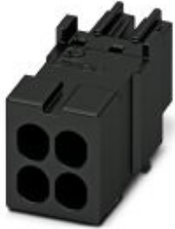
Accessories, number of positions: 2, pitch: 2.54 mm, color: black

Please be informed that the data shown in this PDF Document is generated from our Online Catalog. Please find the complete data in the user's documentation. Our General Terms of Use for Downloads are valid ( http://phoenixcontact.com/download )