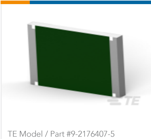
3560 100R 5%