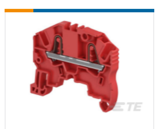
TE Model / Part #1SNK705062R0000 ZK2.5-RD