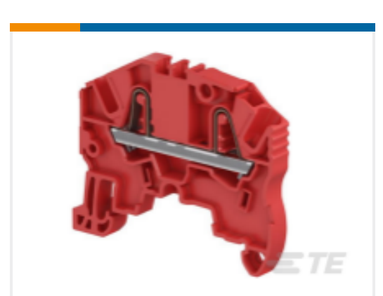
TE Model / Part #1SNK705062R0000 ZK2.5-RD