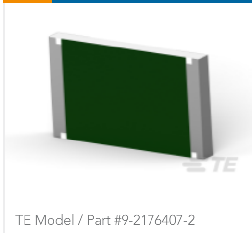
3560 56R 5%