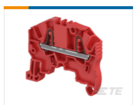
TE Model / Part #1SNK705062R0000 ZK2.5-RD