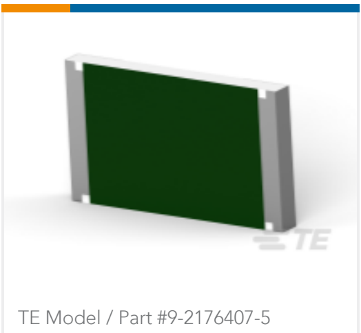
3560 100R 5%