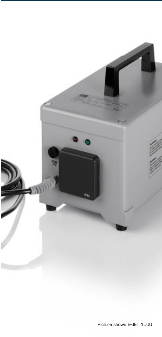
Picture shows E-JET 1000