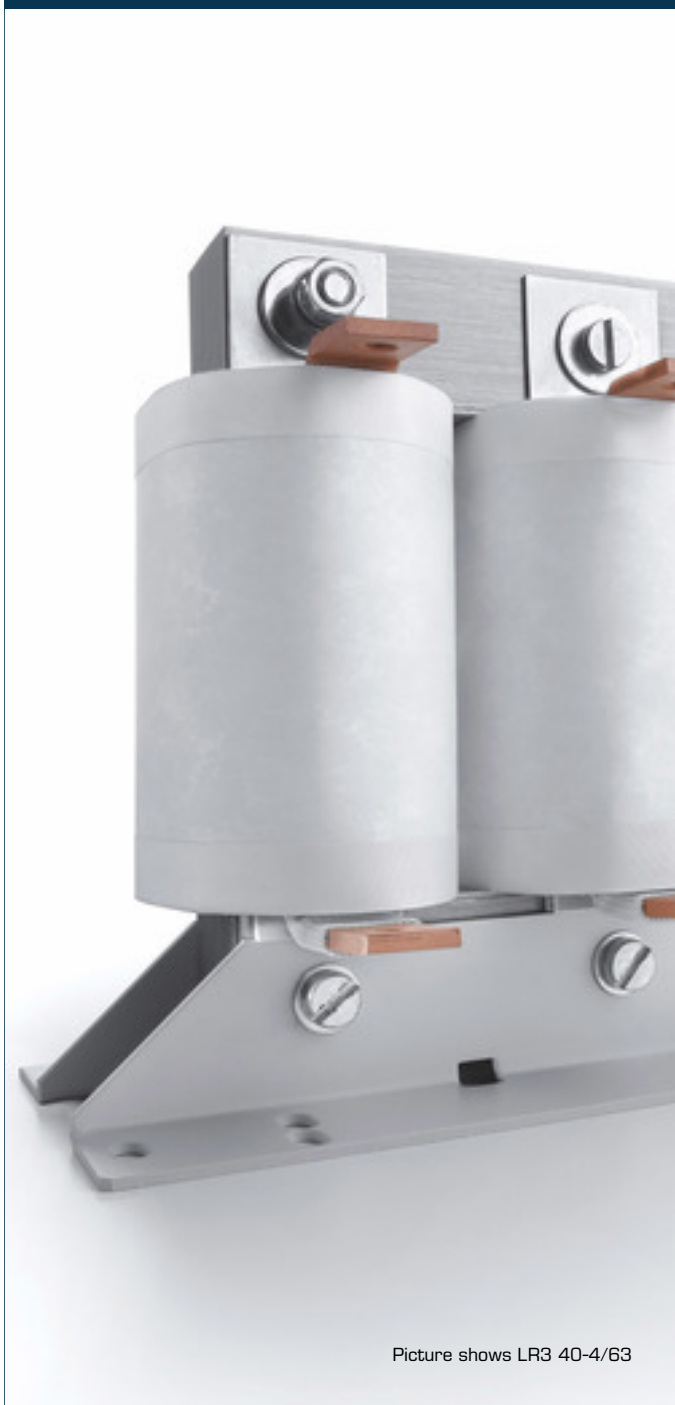
Picture shows LR3 40-4/63