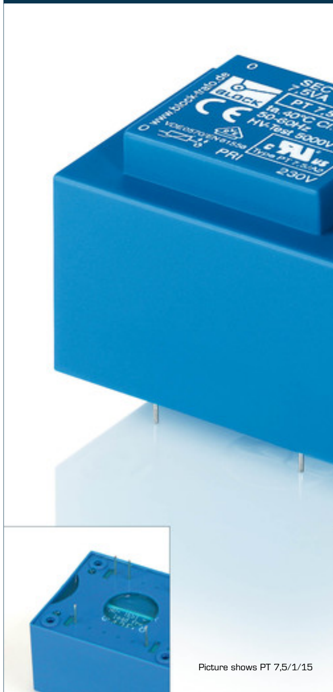
Picture shows PT 7,5/1/15