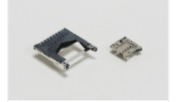
SD Card Connectors(1)