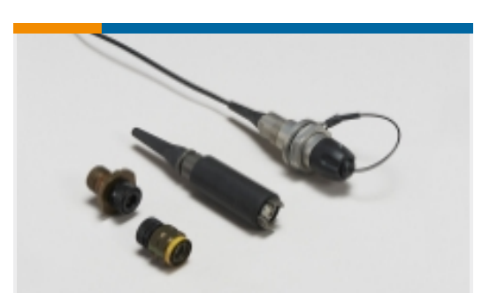
Expanded Beam Fiber Optics(9)