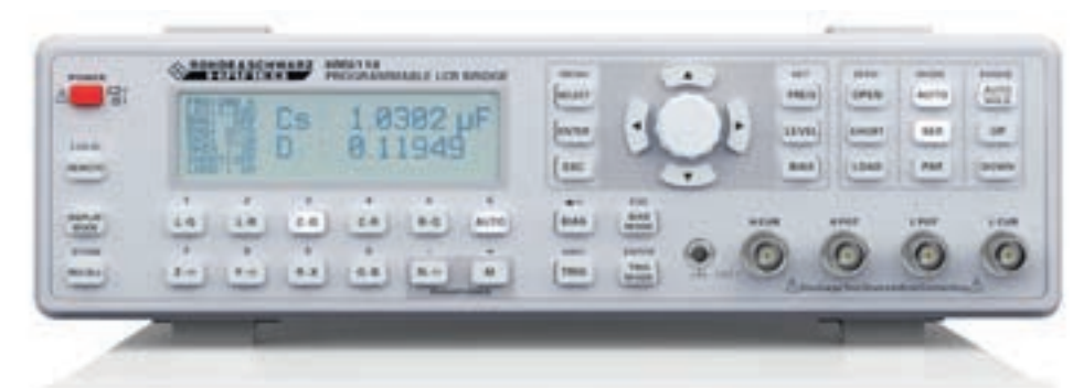
R&S®HM8118 Programmable LCR Bridge