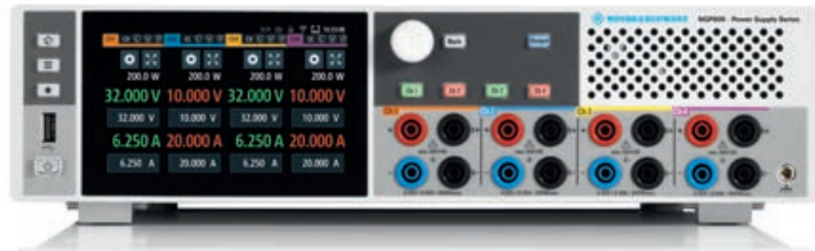
R&S®NGP 800 Power Supply Series