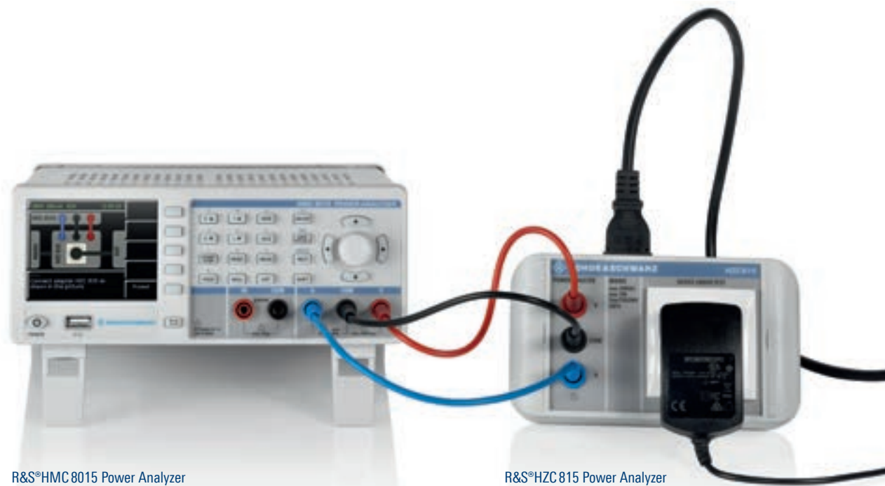
R&S®HMC 8015 Power Analyzer