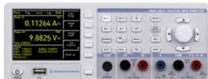
R&S®HMC8012 Digital Multimeter