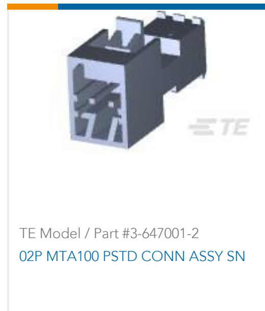
TE Model / Part #3-647001-2 02P MTA100 PSTD CONN ASSY SN