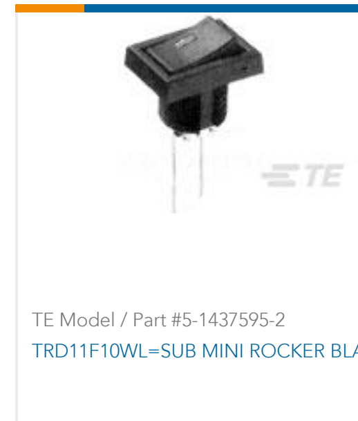
TE Model / Part #5-1437595-2 TRD11F10WL=SUB MINI ROCKER BLA