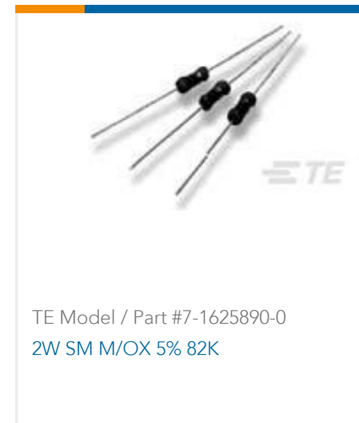
TE Model / Part #7-1625890-0 2W SM M/OX 5% 82K