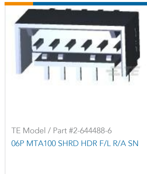
TE Model / Part #2-644488-6 06P MTA100 SHRD HDR F/L R/A SN