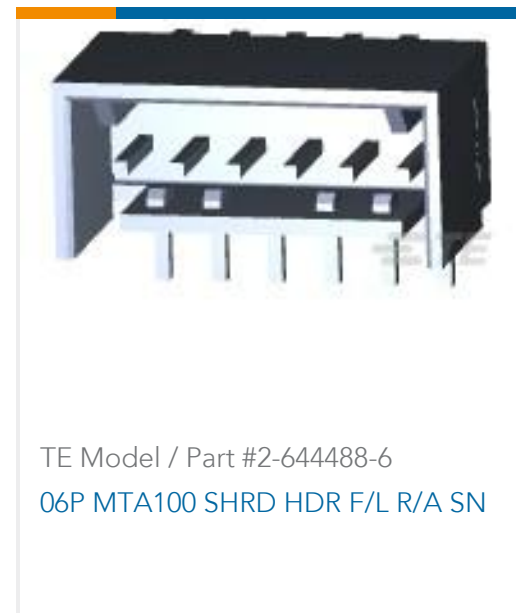
TE Model / Part #2-644488-6 06P MTA100 SHRD HDR F/L R/A SN