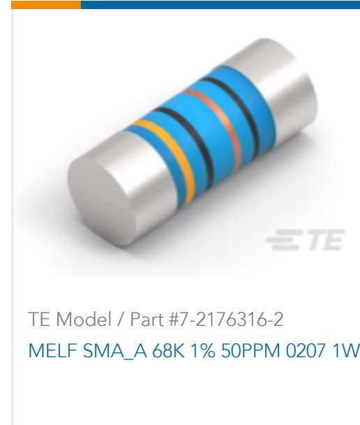
TE Model / Part #7-2176316-2 MELF SMA_A 68K 1% 50PPM 0207 1W