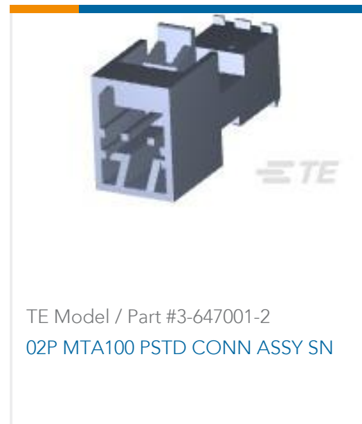
TE Model / Part #3-647001-2 02P MTA100 PSTD CONN ASSY SN