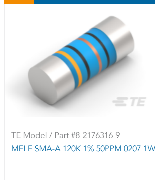
TE Model / Part #8-2176316-9 MELF SMA-A 120K 1% 50PPM 0207 1W