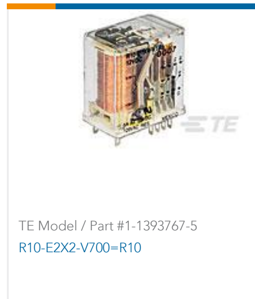
TE Model / Part #1-1393767-5 R10-E2X2-V700=R10