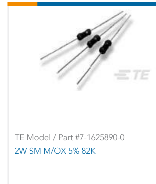
TE Model / Part #7-1625890-0 2W SM M/OX 5% 82K