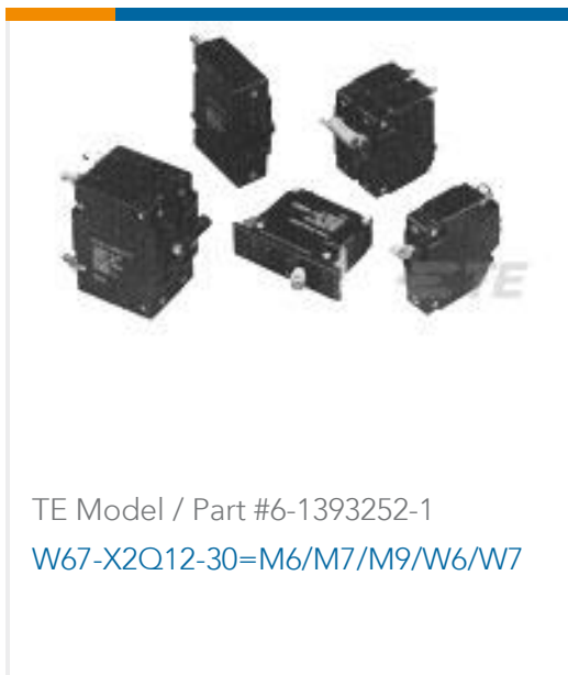
TE Model / Part #6-1393252-1 W67-X2Q12-30=M6/M7/M9/W6/W7