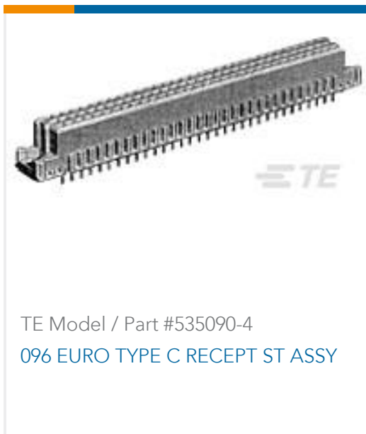
TE Model / Part #535090-4 096 EURO TYPE C RECEPT ST ASSY