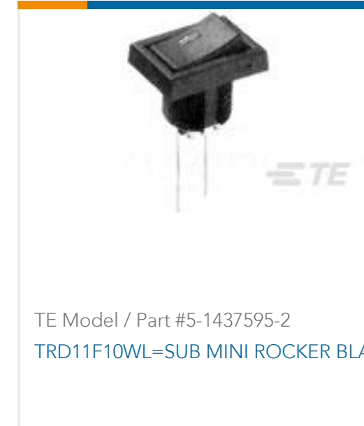
TE Model / Part #5-1437595-2 TRD11F10WL=SUB MINI ROCKER BLA