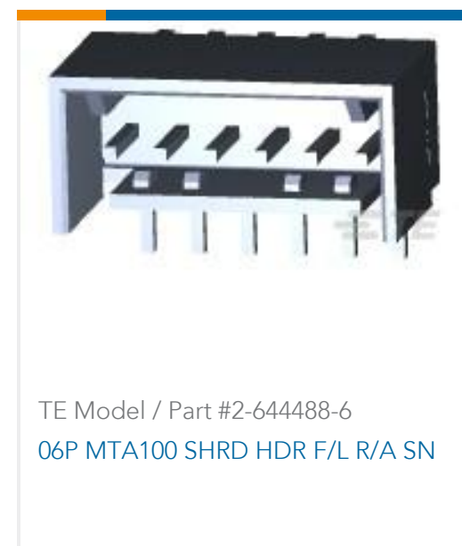
TE Model / Part #2-644488-6 06P MTA100 SHRD HDR F/L R/A SN