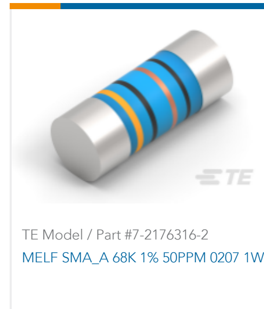
TE Model / Part #7-2176316-2 MELF SMA_A 68K 1% 50PPM 0207 1W