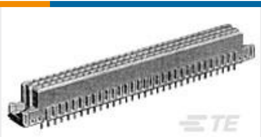
TE Model / Part #535090-4 096 EURO TYPE C RECEPT ST ASSY