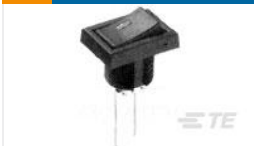
TE Model / Part #5-1437595-2 TRD11F10WL=SUB MINI ROCKER BLA