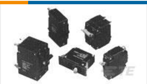
TE Model / Part #6-1393252-1 W67-X2Q12-30=M6/M7/M9/W6/W7