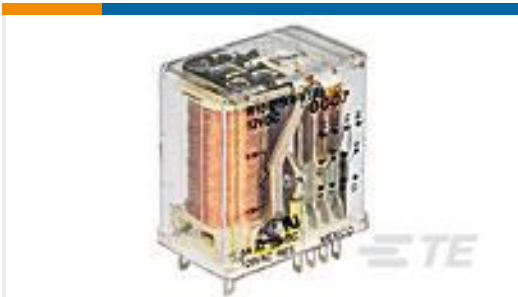
TE Model / Part #1-1393767-5 R10-E2X2-V700=R10