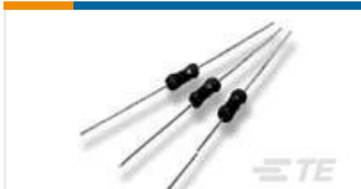
TE Model / Part #7-1625890-0 2W SM M/OX 5% 82K