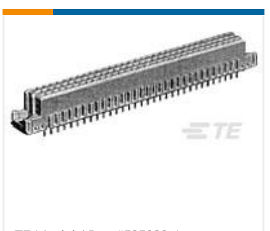
190-4 TE Model / Pa