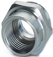
Housing screw connection with M12 standard thread, with O-ring, for 2-piece K, L, and M-coded THR contact carriers

Please be informed that the data shown in this PDF Document is generated from our Online Catalog. Please find the complete data in the user's documentation. Our General Terms of Use for Downloads are valid ( http://phoenixcontact.com/download )