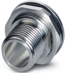
Housing screw connection with M12 standard thread, with O-ring, for 2-piece K, L, and M-coded THR contact carriers

Please be informed that the data shown in this PDF Document is generated from our Online Catalog. Please find the complete data in the user's documentation. Our General Terms of Use for Downloads are valid ( http://phoenixcontact.com/download )