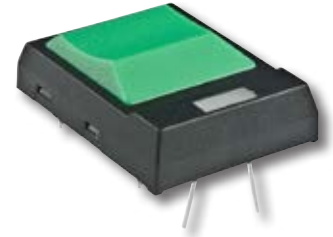
JF Series spot illuminated tactiles will have LED revisions.

1. The LED specifications for JF Series spot illuminated tactile switches will be undergoing changes. This will result in revisions to the electrical values, and will apply to red, yellow and green LEDs for standard or custom switches. Following is the comparison between the specifications before and after the changes. Effected standard part numbers are on page 2.