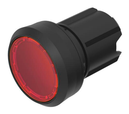
Attention: The preview is based on a sample product. This can differ from your current configuration.