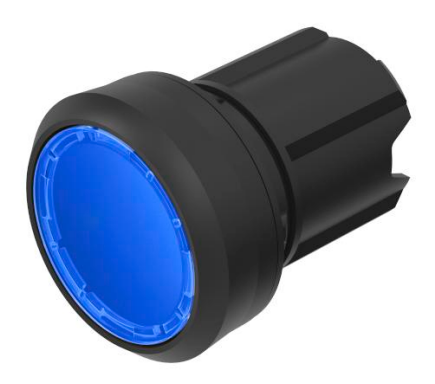
Attention: The preview is based on a sample product. This can differ from your current configuration.