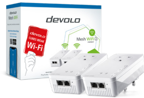
devolo Mesh WiFi 2 Starter Kit 08756 (UK)