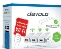
devolo Mesh WiFi 2 Whole Home Wi-Fi Kit: Art. no.: 08761 (UK)