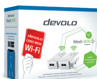
devolo Mesh WiFi 2 Starter Kit: Art. no.: 08756 (UK)