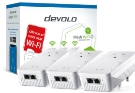
devolo Mesh WiFi 2 Whole Home Kit 08761 (UK)