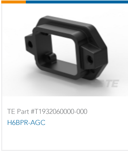
TE Part #T1932060000-000 H6BPR-AGC