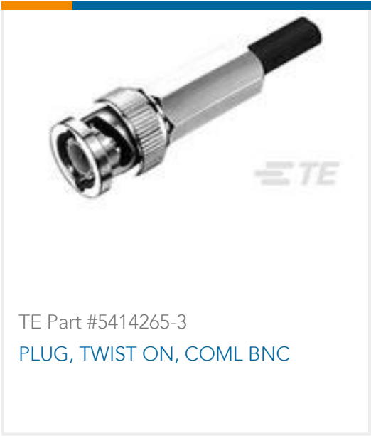
TE Part #5414265-3 PLUG, TWIST ON, COML BNC