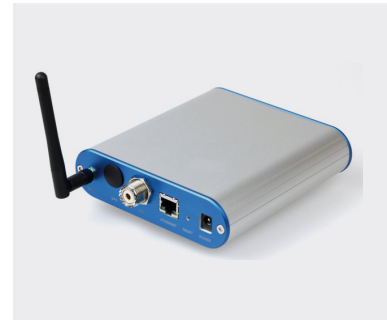
Coloured end panels available upon request