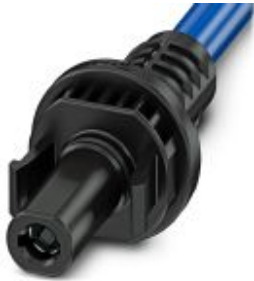
Photovoltaic connector, Range of articles: SUNCLIX, Photovoltaic connector, housing material: PPE, color: black, Connection method: Crimp, Type of contact: Socket

Please be informed that the data shown in this PDF Document is generated from our Online Catalog. Please find the complete data in the user's documentation. Our General Terms of Use for Downloads are valid ( http://phoenixcontact.com/download )