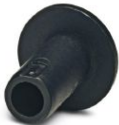
Photovoltaic connector, Range of articles: SUNCLIX, Filler plugs, color: black

Please be informed that the data shown in this PDF Document is generated from our Online Catalog. Please find the complete data in the user's documentation. Our General Terms of Use for Downloads are valid ( http://phoenixcontact.com/download )