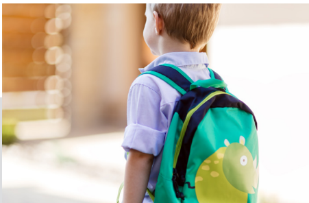
PUBLIC AND EDUCATION