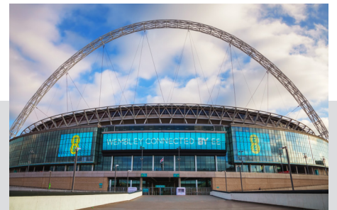
SPORTS AND LEISURE

Protect people from potential coronavirus carriers and those with other infectious diseases – the VIRALERT 3 screens visitors at entry for elevated temperatures that could indicate fever.