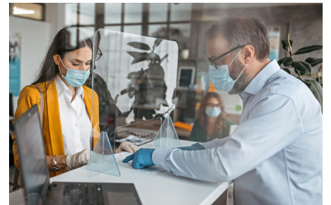
OFFICES AND MANUFACTURING