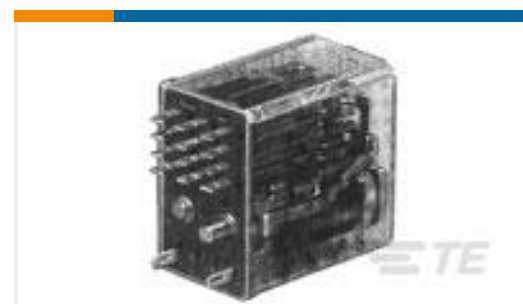
TE Part #1-1393767-3 R10-E2X2-V28=R10