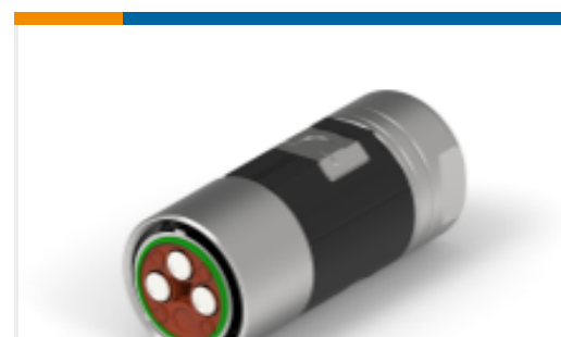
TE Part #DSA001N00740001000 958 PLUG