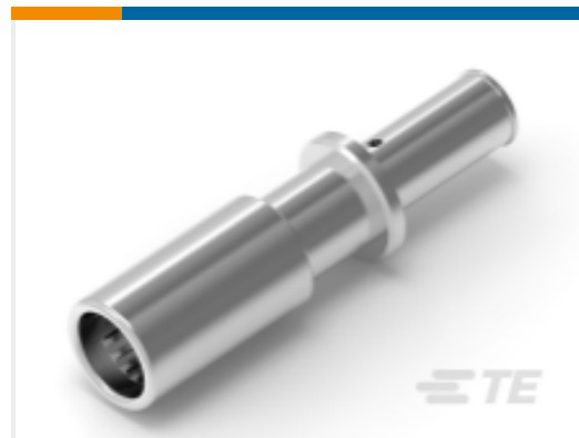
TE Part #60-0102-023-000 CONTACT SOCKET 10 MM