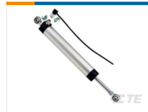
TE Part #04-1270-0035 CLWG-300