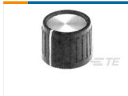
TE Part #6-1437624-6 PKG60B1/8=KNOB PLASTIC BLK 1/8