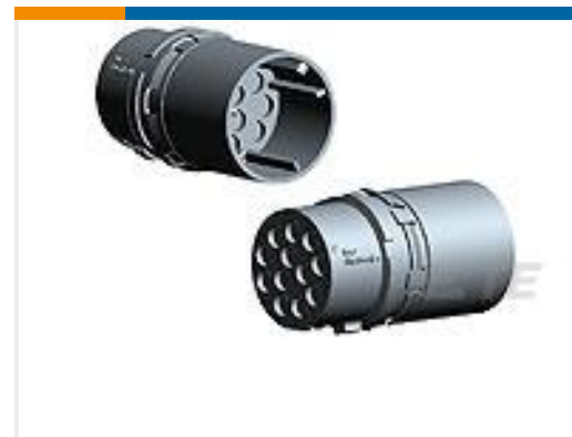
TE Part #1103431-1 MALE INSERT, CRIMP, 12-POS. TYPE III+