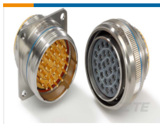
TE Part #ZPF000000000007174 983-ORS 08-98 PN