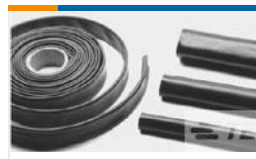
TE Part #CS8624-000 BSTS-15X4FR/NM