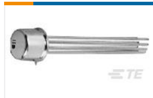
TE Part #1617119-5 J1MAW-18XP = M39016/7-021P