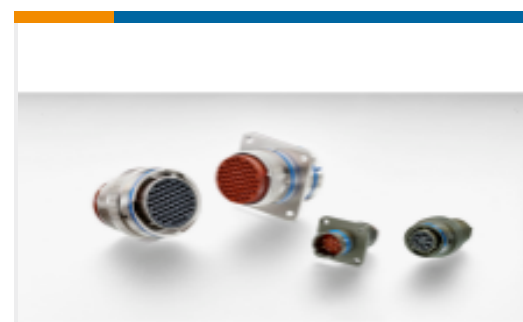
TE Part #YAFD56-14-15SWC019 PLUG ASSY