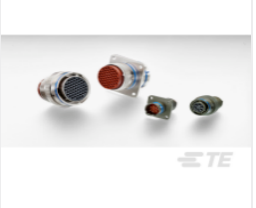
TE Part #YAFD56-14-15SWC019 PLUG ASSY