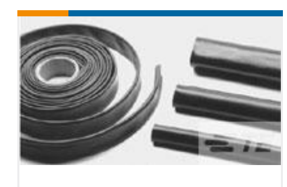
TE Part #CS8624-000 BSTS-15X4FR/NM