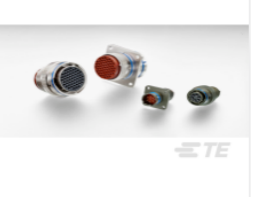
TE Part #YAFD56-14-15SWC019 PLUG ASSY