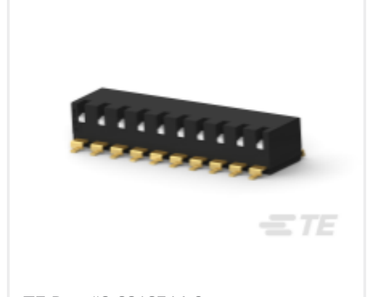
TE Part #2-2319/64-0 E STACK PIANO 10P G SHORT TUBE PD OFF