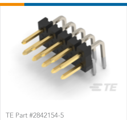
10P,2MM,BRK HDR,DRRT,2.8,0.1AU, TB W/CAP