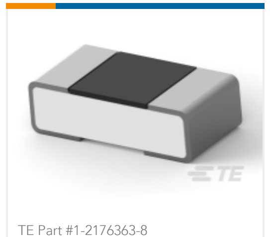
RQ 0402 649R 0.1% 10PPM 5K RL