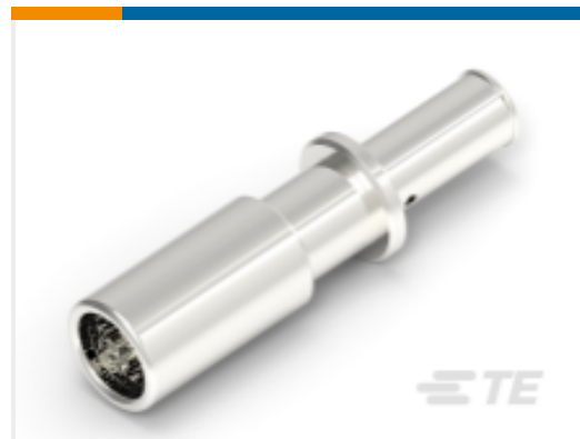
TE Part #60-0101-023-000 CONTACT SOCKET 10 MM