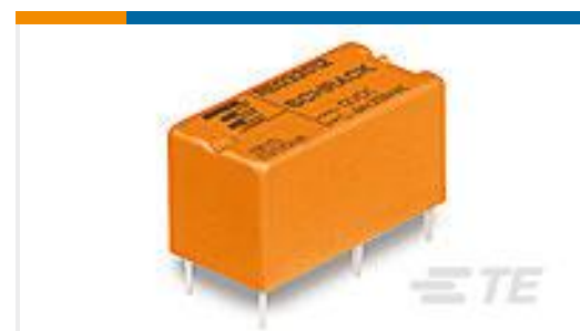
TE Part #1-1393217-7 RE031021