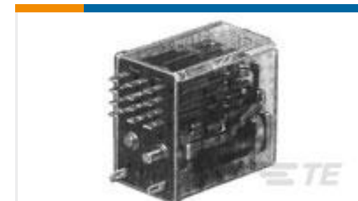
TE Part #1-1393767-6 R10-E2X2-115V=R10