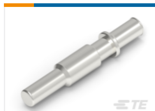
TE Part #61-0114-023-000 CONTACT PIN 10 MM