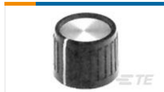
TE Part #6-1437624-6 PKG60B1/8=KNOB PLASTIC BLK 1/8