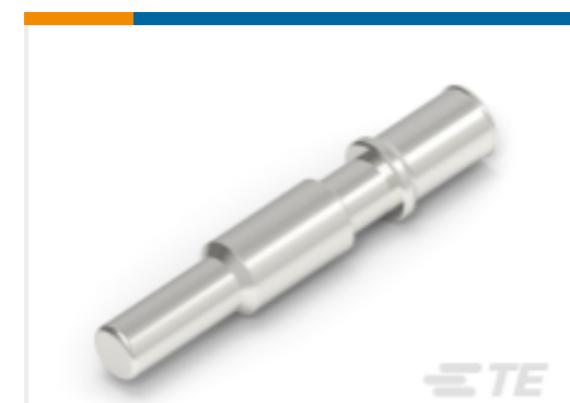
TE Part #61-0115-023-000 CONTACT PIN 10 MM