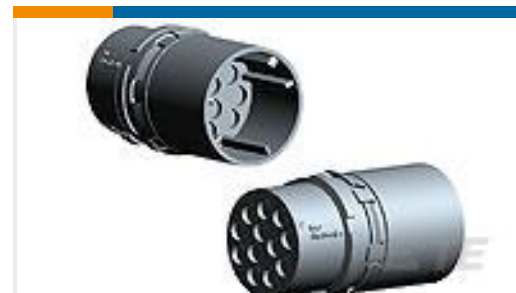
TE Part #1103431-1 MALE INSERT, CRIMP, 12-POS. TYPE III+