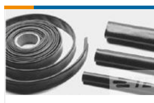
TE Part #CX1369-000 BSTS-13X4FR/NM