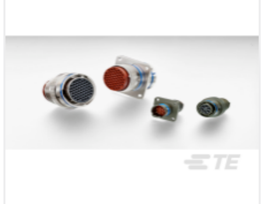
TE Part #YAFD56-14-15SWC019 PLUG ASSY