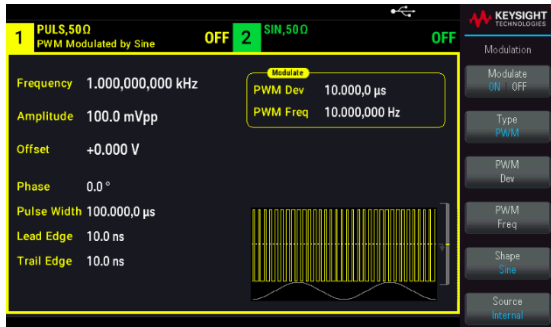
Figure 3. PWM modulated with standard sine wave