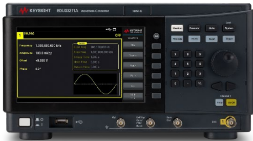
Keysight EDU33211A 20 MHz, single-channel function/arbitrary waveform generator