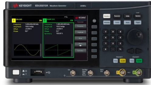
Keysight EDU33212A 20 MHz, dual-channel function/arbitrary waveform generator