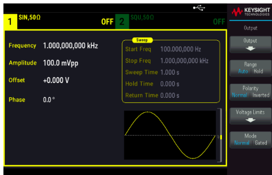
Figure 1. Standard sine wave and setting

The EDU33210 Series 20 MHz function / arbitrary waveform generators has 17 built-in arbitrary waveforms. It comes with common waveforms — sine, square, ramp, triangle, pulse, PRBS, DC, and Gaussian noise; see Figures 1 and 2. It has specialty waveforms such as cardiac, exponential fall, exponential rise, Gaussian pulse, haversine, Lorentz, D-Lorentz, negative ramp, and sinc; see Figures 3 and 4. The six built-in modulations are AM, FM, phase modulation (PM), frequency-shift keying (FSK), binary phase shift keying (BPSK), and pulse width modulation (PWM).