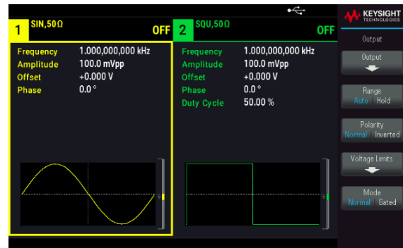
Figure 2. Dual-screen display of standard sine and square wave