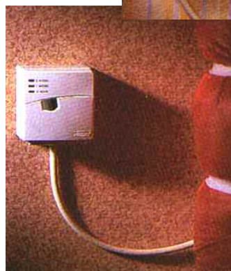
Immersion Heater Control