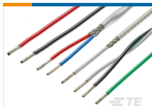
TE Part #893755-000 44A0121-16-9/96CS2275