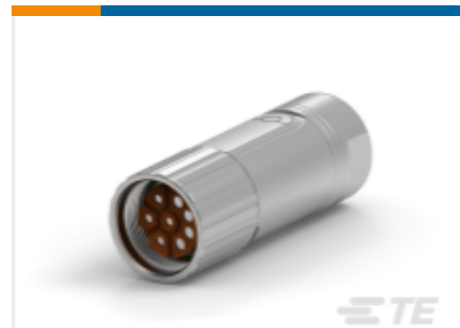
TE Part #BSA078N00420235000 923 PLUG