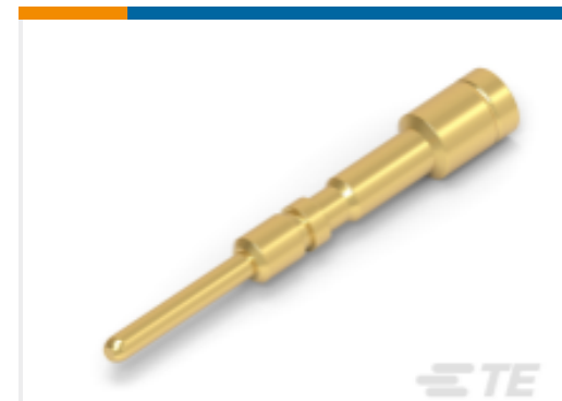
TE Part #61-0027-011-000 CONTACT PIN 2 MM