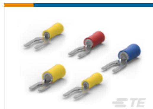
TE Part #52923 PIDG LONG SPRING SPADE TONGUE TERMINALS