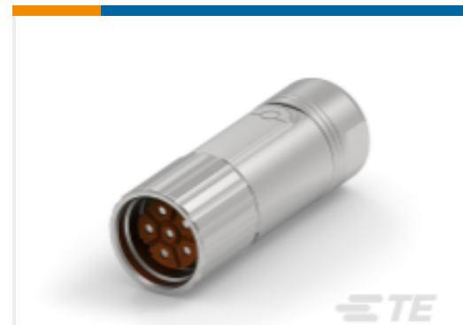
TE Part #BSA085N00580235000 923 PLUG