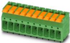
The figure shows an 10-position version

Please be informed that the data shown in this PDF Document is generated from our Online Catalog. Please find the complete data in the user's documentation. Our General Terms of Use for Downloads are valid ( http://phoenixcontact.com/download )